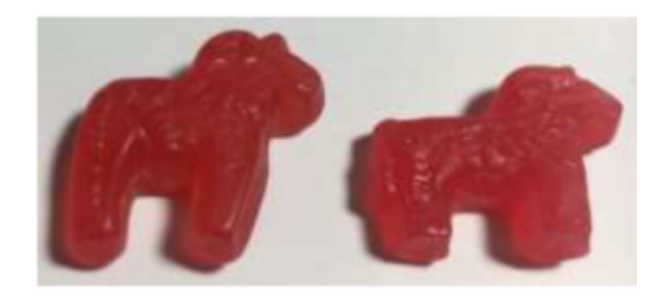
Product 1 Product 2

Dalecarlia sued Candy People AB (Candy People) for marketing, manufacturing and distributing the candy shown below, arguing that such use infringed Dalecarlia's rights. Dalecarlia requested the court to prohibit Candy People' use of these products.