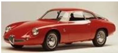
Alfa Romeo Giulietta SZ

With decision n. 482 of 2019 the Italian Court of Torino decided on whether the beauty and the history of a car may be reasons to deserve copyright protection. The case regards the company Tecnomodel S.r.l. producer of miniature cars, including the models in scale 1/18 and 1/43 of the cars Alfa Romeo Giulietta SZ and Lancia D24, shown below.