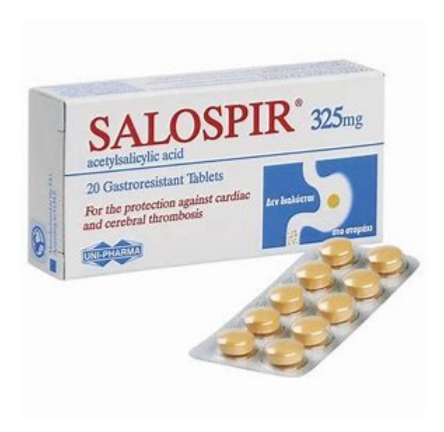
and the new one is

Recently a Greek pharmaceuticals company decided to change its pain killer package and adopt a new one. The old package of the Greek company was