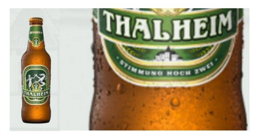
Snippets from https://www.thalheimerheilwasser.at/

In conclusion, the protection of slogan trademarks in Austria is rather difficult, as everywhere, but still a bit easier than it is for EUTMs. To defend that a slogan has the required minimum distinctiveness, it may be worth going all the way to the OGH, who often has a more liberal approach to the distinctiveness test. I am curious to learn what the courts or other bloggers may have to add to the topic!