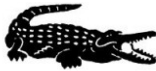
Lacoste's device mark

In a recent decision, the Court of Appeal of The Hague concluded that there is a confusing similarity between Lacoste's device mark consisting of a picture of a crocodile, registered for (among other things) cosmetic products in class 3, and the word mark EAU CROCO for the same products. The case concerned an application by a Dutch company for the trade mark EAU CROCO, which was opposed by Lacoste primarily on the basis of the Community trade mark registration for its device mark consisting of the image of a crocodile.