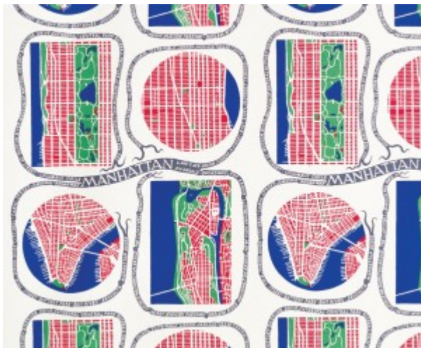
EUTM registration No 10 540 268 'Manhattan'

This case relates to the famous Swedish design house Svenskt Tenn Aktiebolag ('Svenskt Tenn') which was formed in the 1920's. Svenskt Tenn owns the copyright to, inter alia, the textile pattern 'Manhattan', which is a renowned design pattern in Sweden, also registered by Svenskt Tenn as a figurative EUTM in 2012.