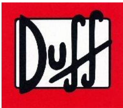
Claimant’s EUTM 8351091

The Claimant, Twentieth Century Fox Film Corporation, producer of the famous “ The Simpsons ” TV series, in which “Duff beer” designates a fictitious beer, owns EUTM no. 8351091 “Duff” for, inter alia, beer in class 32, and sued German Duff Beer GmbH for producing (or having produced) beer under the mark “Duff” in Austria and having it delivered from Austria to Germany. While the Claimant’s EUTM for “Duff” (fig.) was applied for in 2009 and registered on 26 March 2014 (so non-use of the fictitious mark was no issue), the Defendant owns German TM no. 39901100 (fig.) for Duff Beer“, filed and registered already in 1999 (on a side note: a claim for revocation of the said mark had been finally denied by the German BGH in 2012 [I ZR 135/11]).