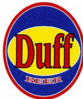
Defendant’s German TM 39901100

In the main proceedings , which were started in parallel with the PI proceedings (this is the normal course of action in Austria) the Defendant brought a counterclaim for declaration of invalidity of EUTM 8351091 „Duff“ on the basis of its earlier German mark. In the PI proceedings , however, a