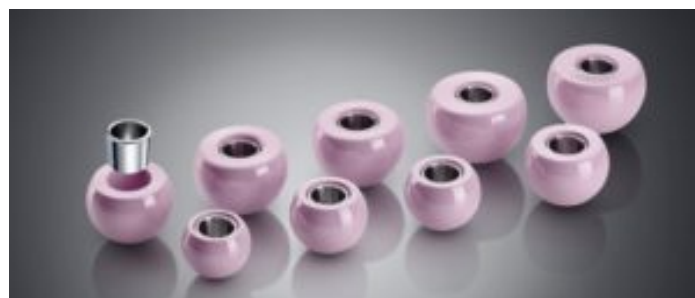
Actual use of the mark for femoral head spheres

The Swiss Federal Institute of Intellectual Property refused protection because the claimed color lacked original distinctiveness, arguing that it would be considered for its aesthetic function and not as an indication of origin. Secondly, the Institute ruled that the applicant had failed to show acquired distinctiveness through use in Switzerland.