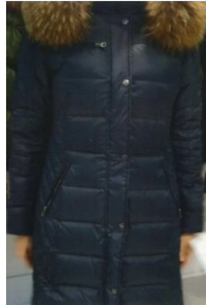
Denasia's sample jacket

The main question before the Court was to determine whether Denasia's prototype- and sample jacket constituted an infringement of SAKI's rights under the Community Design Regulation ("CDR") and the Danish Marketing Practices Act ("MPA").