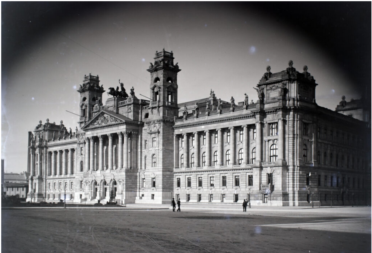
Palace of Justice in Budapest