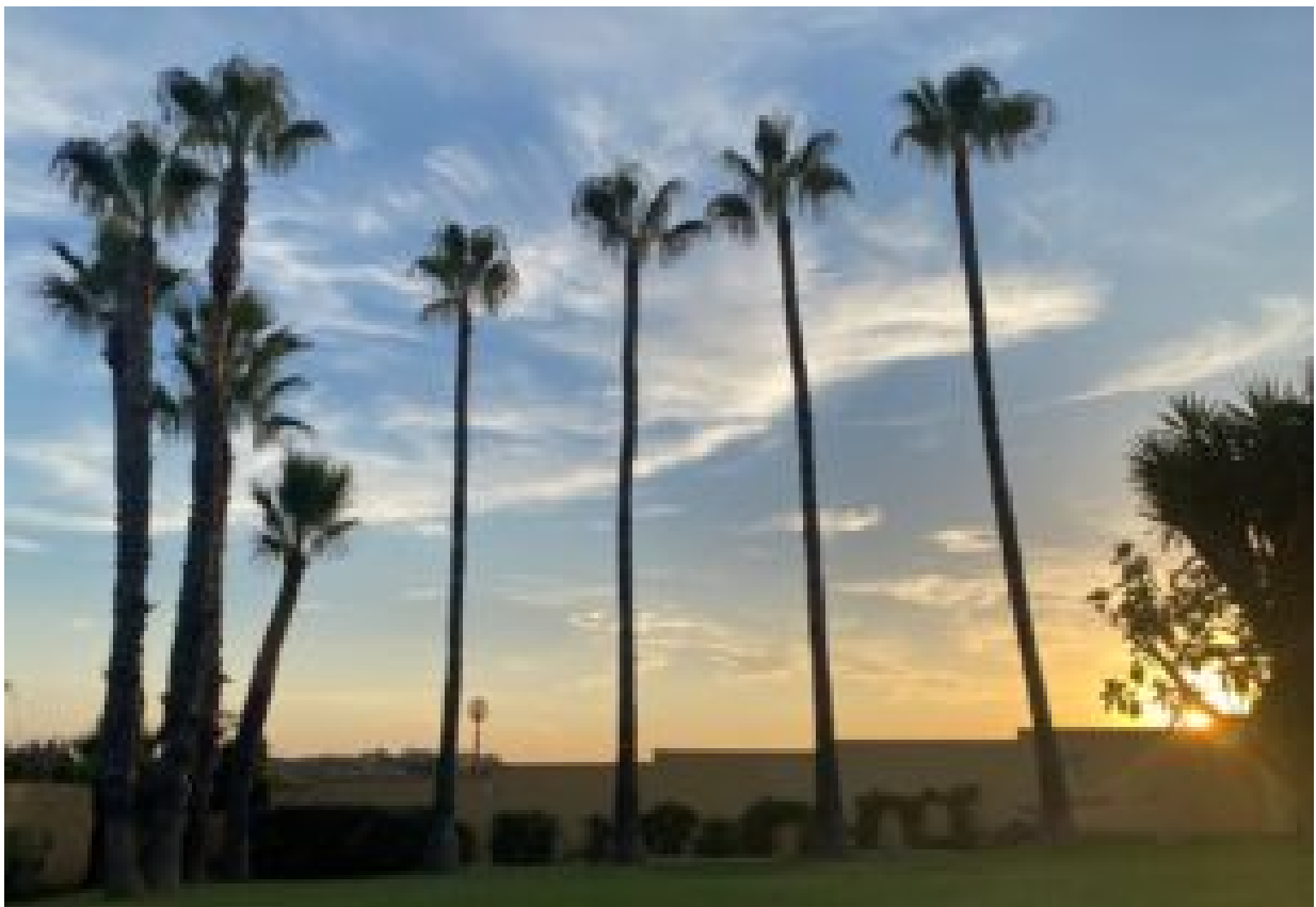
The night setting on contentious administrative appeals in Spain